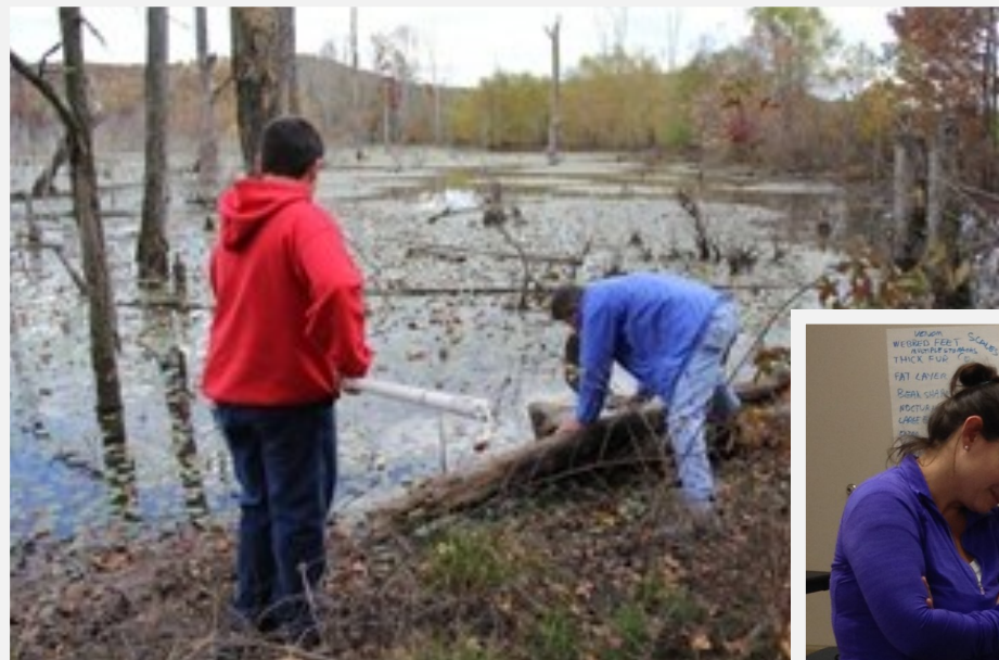
Enterprise South Nature Park Visitor's Center Lunch Provided