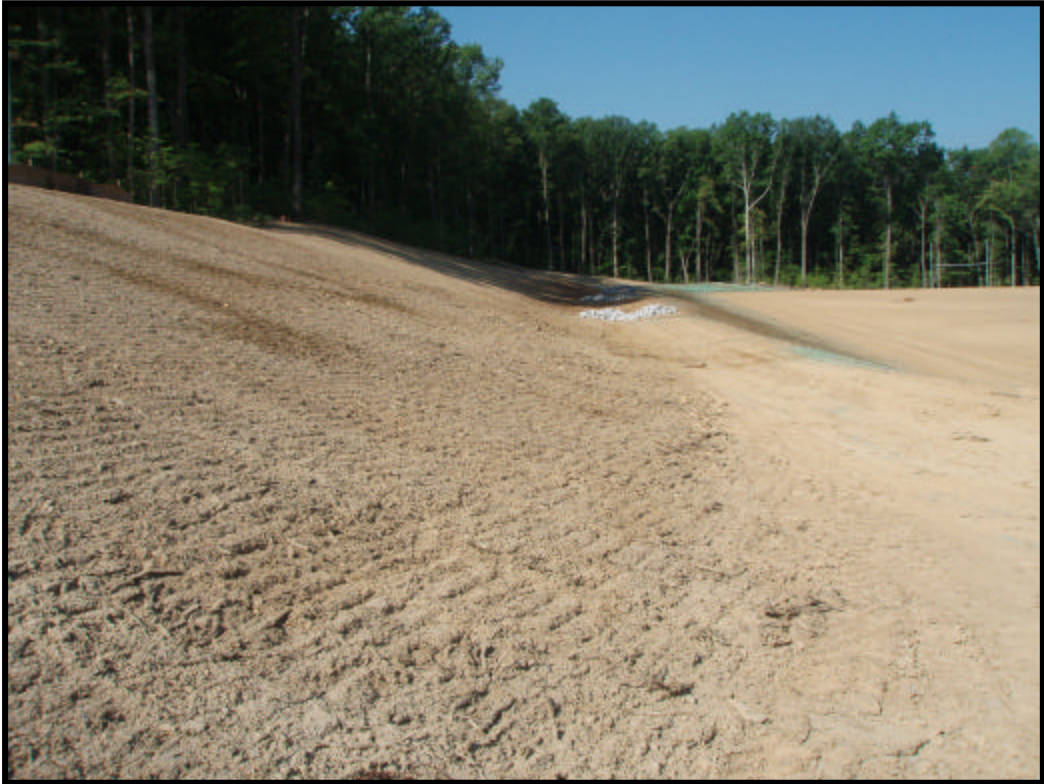
Photo Surfacing Roughening